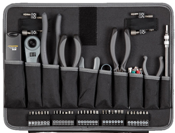
New and improved pallet design to maximize efficiency, capacity and increase aesthetics.